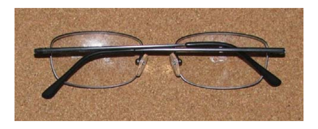
Proper frame alignment- When the temples are closed, they should overlap and be near parallel with the top of the frame.

If the frame has nose pads they should be symmetrical and have slight frontal, splay and vertical angles (complete descriptions to follow). The width should be slightly narrower than the contours of the eyewire.