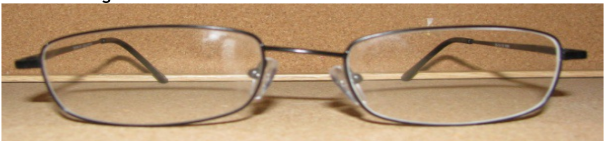
OD Skewed higher than OS